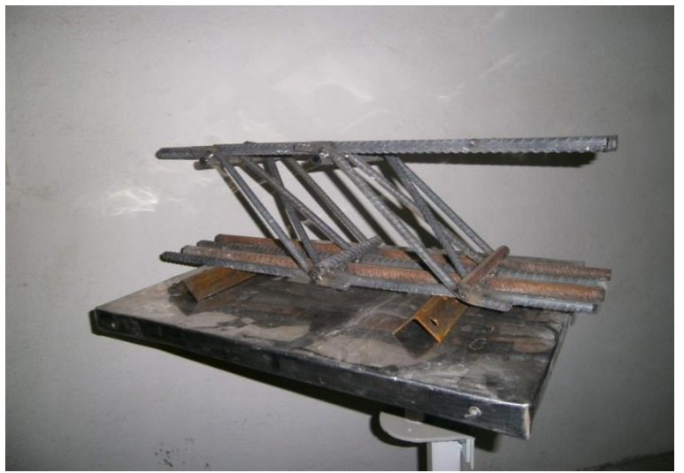
Figure 3: Rectangular swimmer bar system with cross bracings.