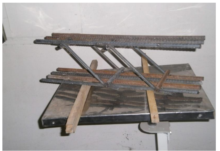
Figure 2: Rectangular swimmer bar system.