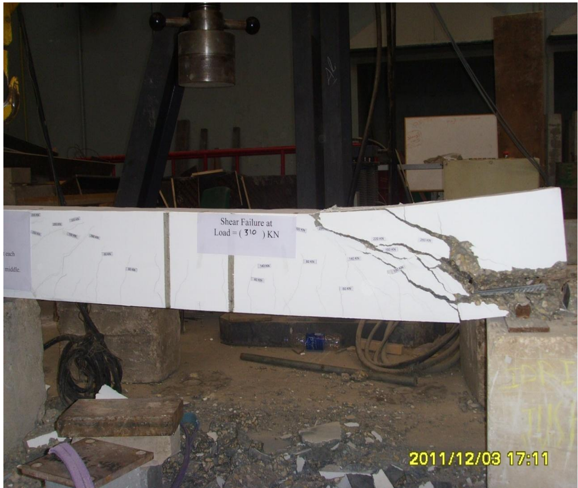
Figure 5: Beam B2, shear failure at the load of 310 kN.

The first beam designated as B1 is used as a reference beam where traditional stirrups were used as shear reinforcement and no swimmer bars. Loading started at 30 kN, where hair cracks appeared in the bottom face between the two applied loads. When loading reached 60 kN hair cracks appeared at the right side of the beam. At the load of 200 kN shear cracks increased in width and length. Finally, shear failure occurred at the load of 260 kN. The beam designated as B2 showed some hair cracks at the load of 140 kN. When the load reached 180kN more hair cracks appeared at the moment region, then by raising the loads up to 220 kN shear cracks appeared at right side of the beam. Finally, shear failure occurred at 310 kN as shown in Fig. 5. Similarly, beams B3, B4, B5, and B6 were studied during the test.