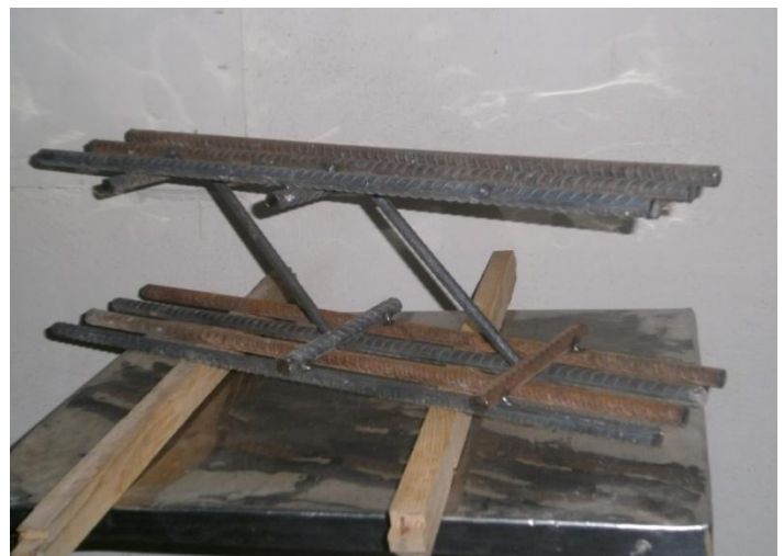
Figure 1: Single swimmer bar system